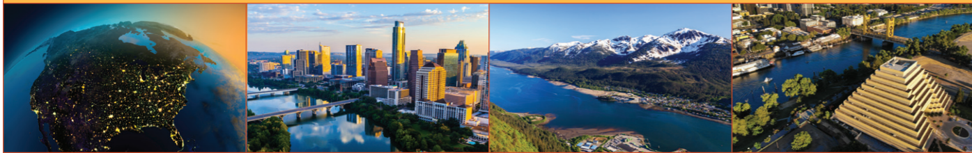
North America and the USA