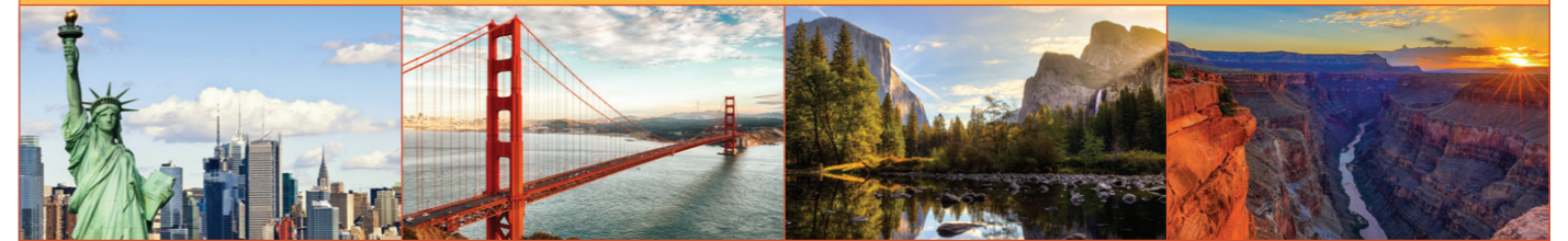
The Statue of Liberty